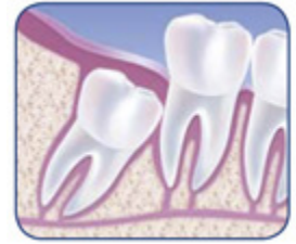
Soft tissue impaction of third molar.